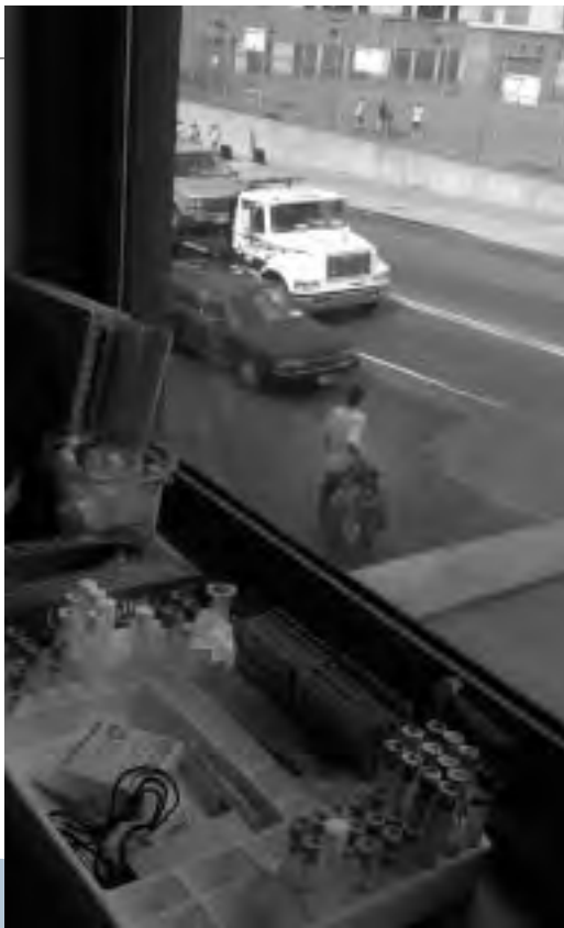
The consultation room at Jenyons's uptown office—at Broadway and 185th—looks out on a middle-school playground.