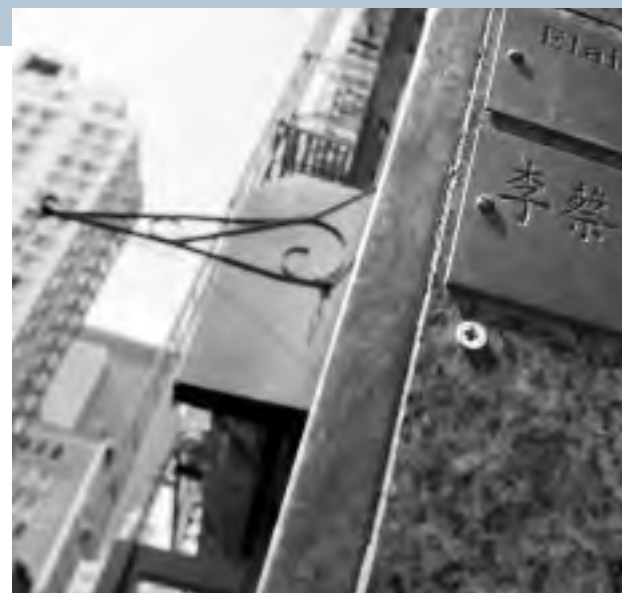
Lee's office is only eight blocks from the site of the World Trade Center. She says there are lots of small businesses in the area, but that "since September 11th, they're not doing so well."