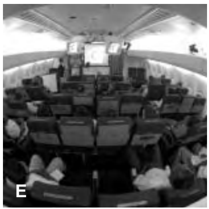
Not an in-flight movie, but live video feed from surgery. Two-way audio facilitates give and take between the visiting and local physicians. During surgery room turnover time, this area is used for lectures.