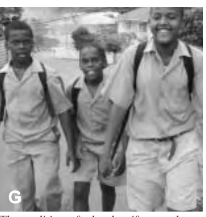
The tradition of school uniforms, photographed on a walk through a middle class neighborhood, is the result of British influence.