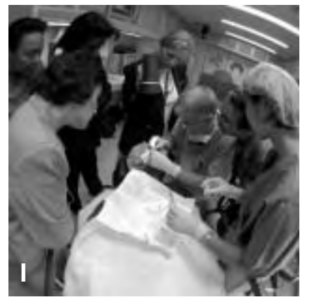
Dr. Black demonstrates an adjustable suture procedure as it would be performed without the benefit of the plane's high-tech operating room.