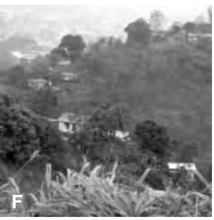
The countryside of Trinidad is lush and tropical: full of mango trees, banana plants and coconut groves.