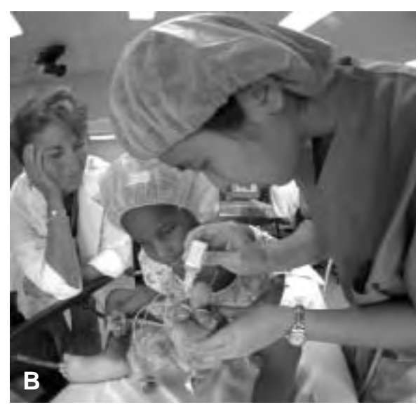
To demonstrate how easy the eye drops are, ORBIS staffers first medicate Shaquilla's Elmo doll.